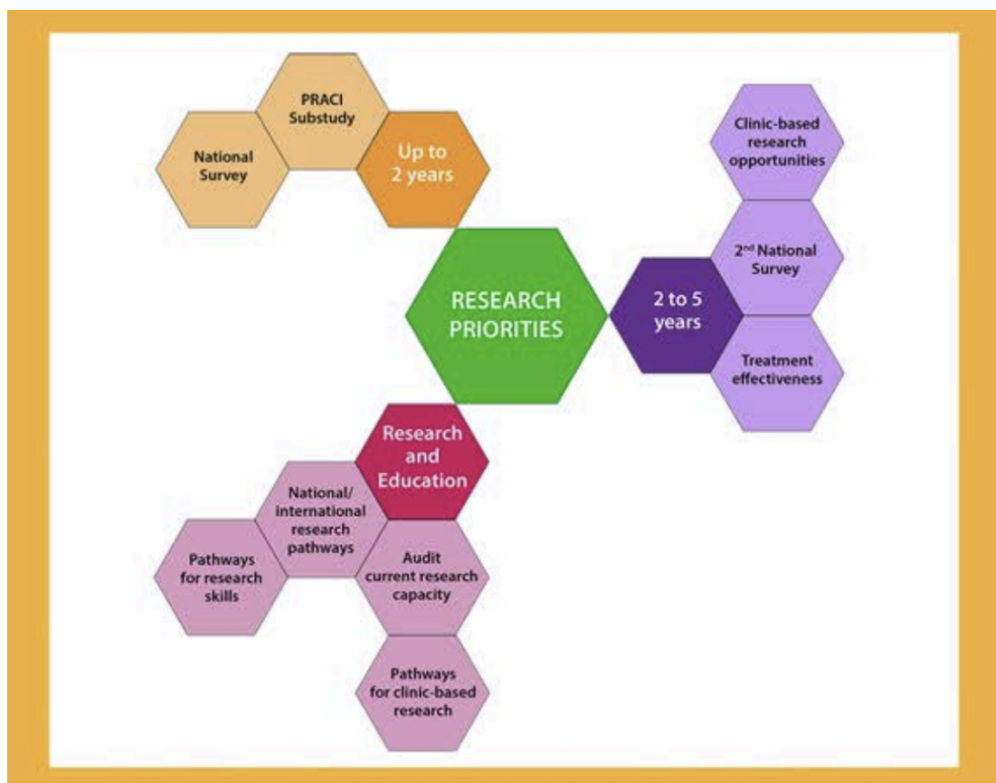
Figure 2. Australian homeopathic research priorities building blocks from 2018 - 2024

The RPWG believes that strong foundations for research activity are being created and are evolving. The initial building blocks (2019 - 2024) are shown in Figure 2.