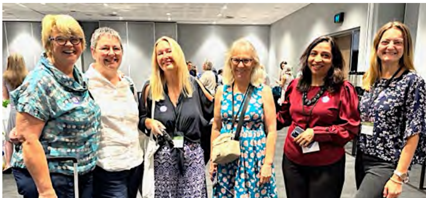
Australian Homoeopathic Medicine Conference November 2023