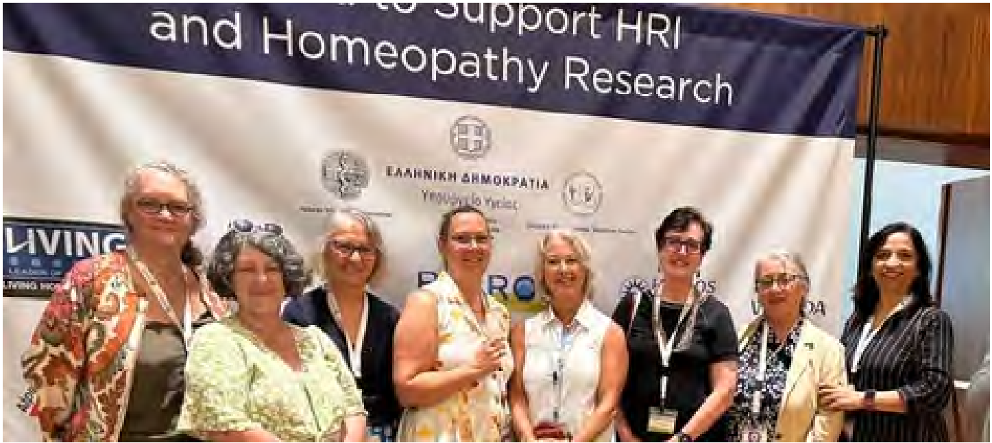
Aurum Project Members and Researchers at HRI Conference, Greece June 2025